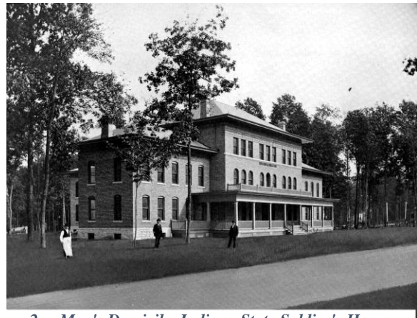
2. Men's Domicile, Indiana State Soldier's Home