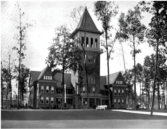
1. Indiana State Soldier's Home at